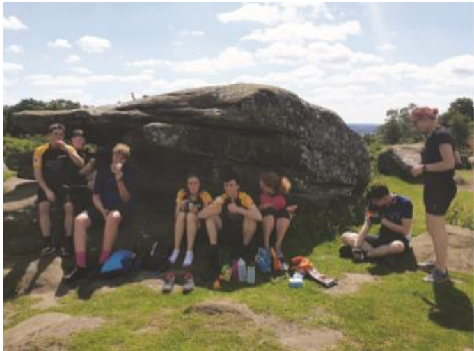
Coast2Coast cycle ride 2019, the next event will take place in 2020