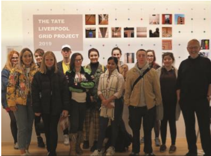
Art & Photography Tate Gallery Trip 2019