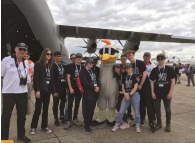
Rocketry Youth Challenge World Champions 2019 at Paris Air Show