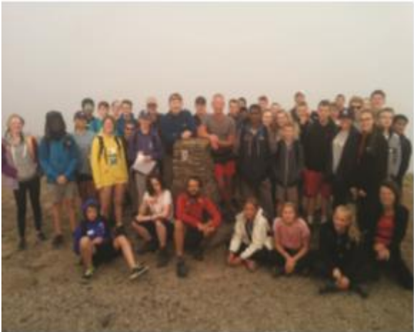
Trip helpers: Year 9 Camp where Year 12 students help with meals and activities