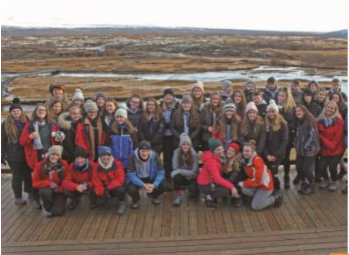
Biennial Geography Trip to Iceland, next running in October 2020