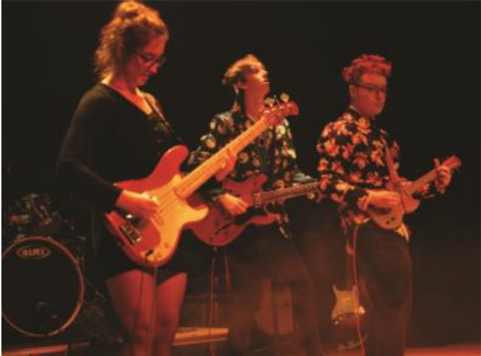
Various music & performing arts opportunities, including the End of Year Concert