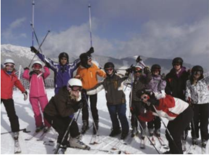
Biennial Ski Trip, next running in February 2021