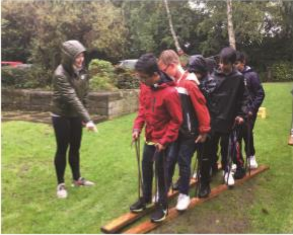
Form Prefects: Giving encouragement to Year 7 students during their residential