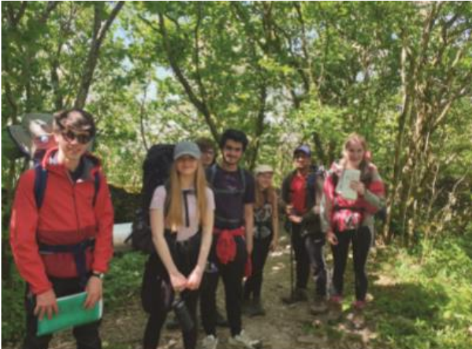
Gold Duke of Edinburgh 2019