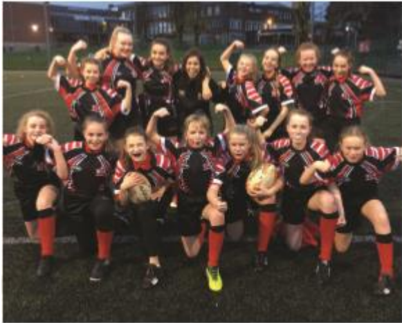
Sports Coaching: numerous opportunities to coach younger students