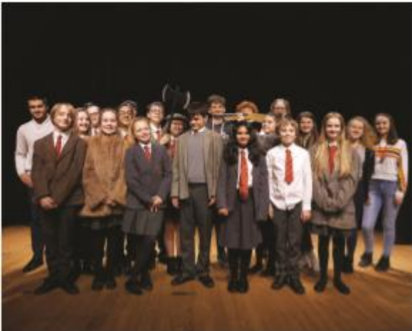
First Bow: Year 12 production team with the cast of Year 7 and Year 8 students