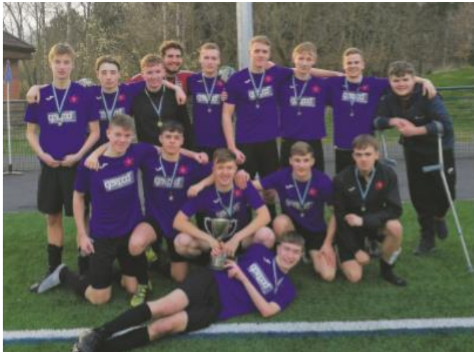
U19 Football - West Yorkshire and Calderdale Champions 2019