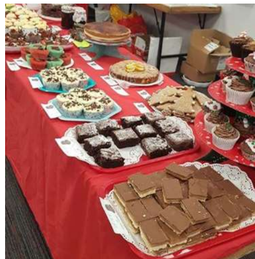
Cake donations - thank you! Parents' Association Christmas Fayre 2019