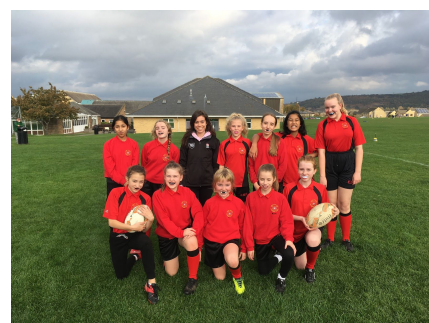
Photo of Year 7 and 8 girls' rugby when they played against Brooksbank. First fixture for most students - great grit and determination.