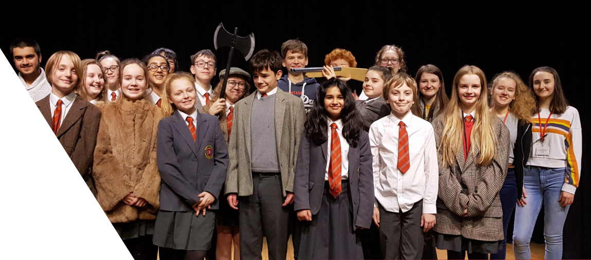
Year 12 production team with Year 7 & 8 cast from one of the First Bow performances in 2019

*Measured using the nationally recognised Alps system. ** 2018 results.